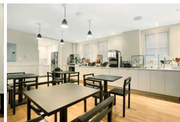
Lobby Breakfast Area