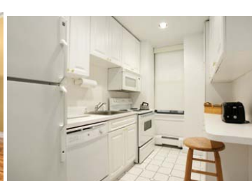
Kitchenettes in all suites

Hospitality House is a newly renovated, apartment suite hotel, designed to be a home away from home. Our suites are huge living spaces with oak floors and 11 foot high ceilings making traveling to New York for business or pleasure entirely comfortable and relaxing. Our 33 oversized suites are luxurious three and four room apartments each have a full kitchen, living-room/dining room, bath room with shower/tub and separate bedrooms each with fine linens and Beautyrest pillow top bed (s). Our fully outfitted kitchens have stoves, ovens, microwaves and dishwashers and all of the equipment one would need to prepare a seven course meal.