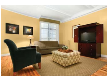
Guest room Living Area