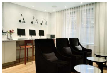
Computer and sitting area