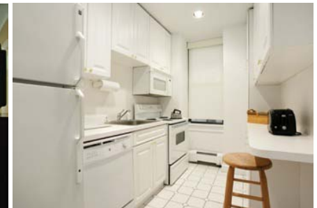
Kitchenettes in all suites

Hospitality House is a newly renovated, apartment suite hotel, designed to be a home away from home. Our suites are huge living spaces with oak floors and 11 foot high ceilings making traveling to New York for business or pleasure entirely comfortable and relaxing. Our 33 oversized suites are luxurious three and four room apartments each have a full kitchen, living-room/dining room, bath room with shower/tub and separate bedrooms. We use only luxurious Simmons Beautyrest pillow top bed s covered with fine linens to ensure a restful sleep. Our fully outfitted kitchens have stoves, ovens, microwaves and dishwashers and all of the equipment one would need to prepare a seven course meal.