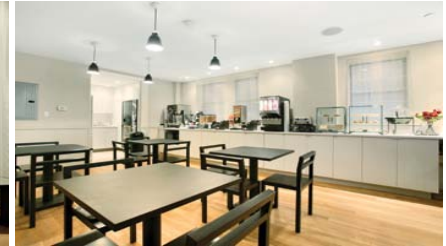
Lobby Breakfast Area