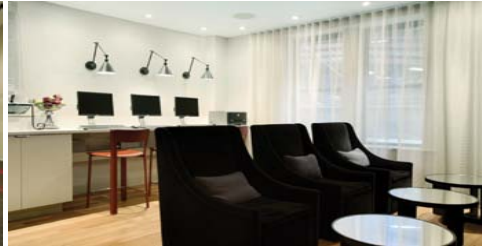
Computer and sitting area