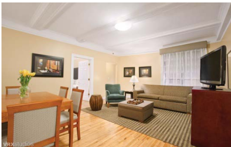
Guest room Living Area